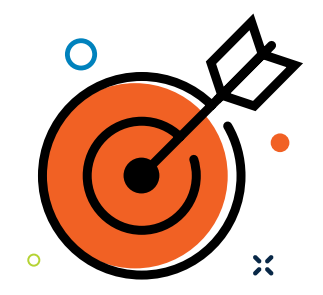
One team, one mission