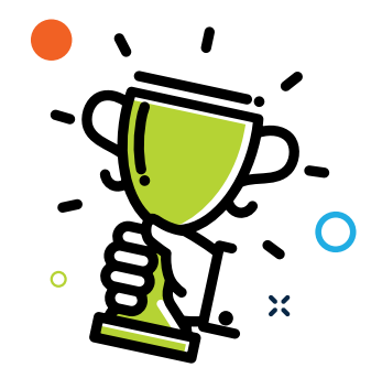
Excellence , always

As a CBLA employee, I undertake to adhere to CBLA's core values: