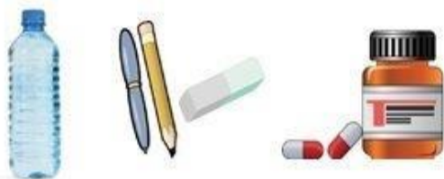
Photo ID, pens, pencils, erasers, water in a clear plastic bottle, prescribed medicine, tissues (not in a box).

Examples of unauthorised items that candidates must not have in a test room: